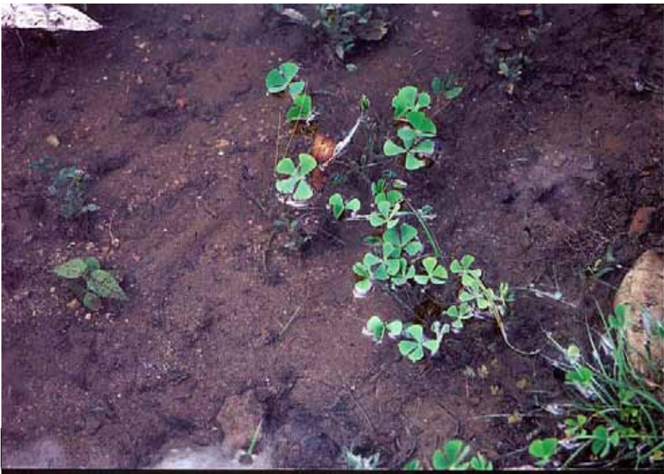
Photograph 31. July 29, 2001. This looks like a clover but it is a fern Marselia mucronata .