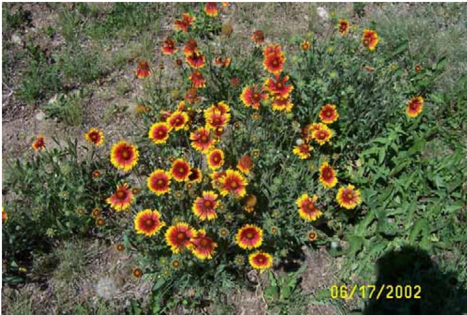
Photograph 39. June 17, 2002.