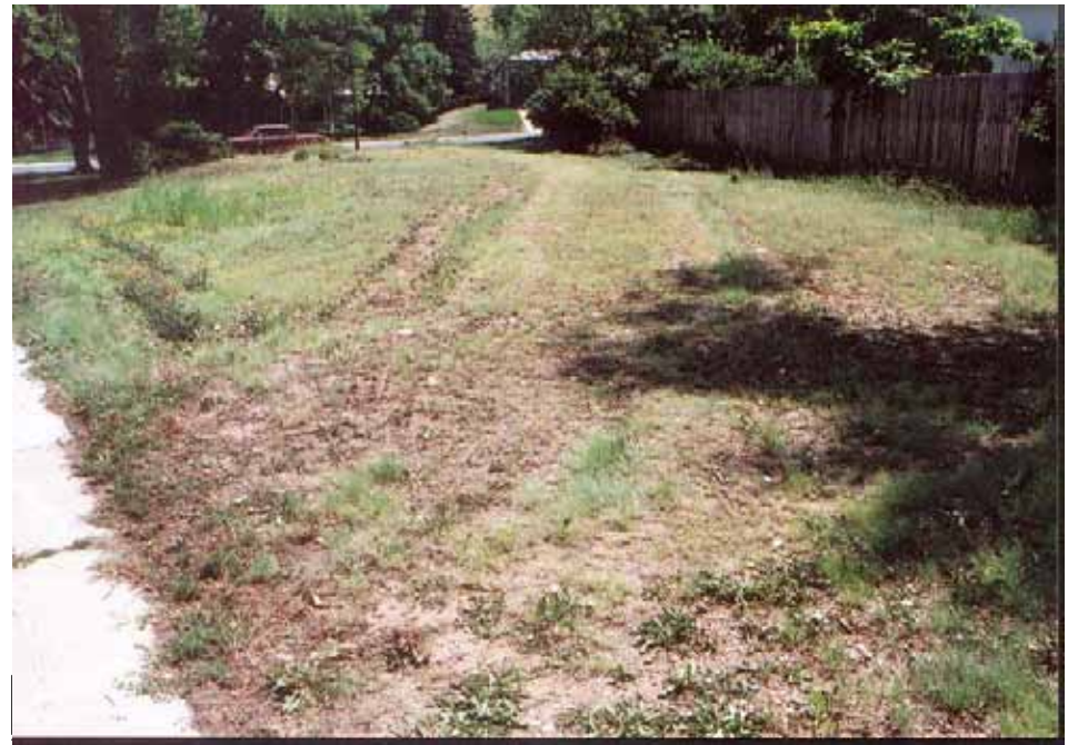
Photograph 28. July 29, 2001.