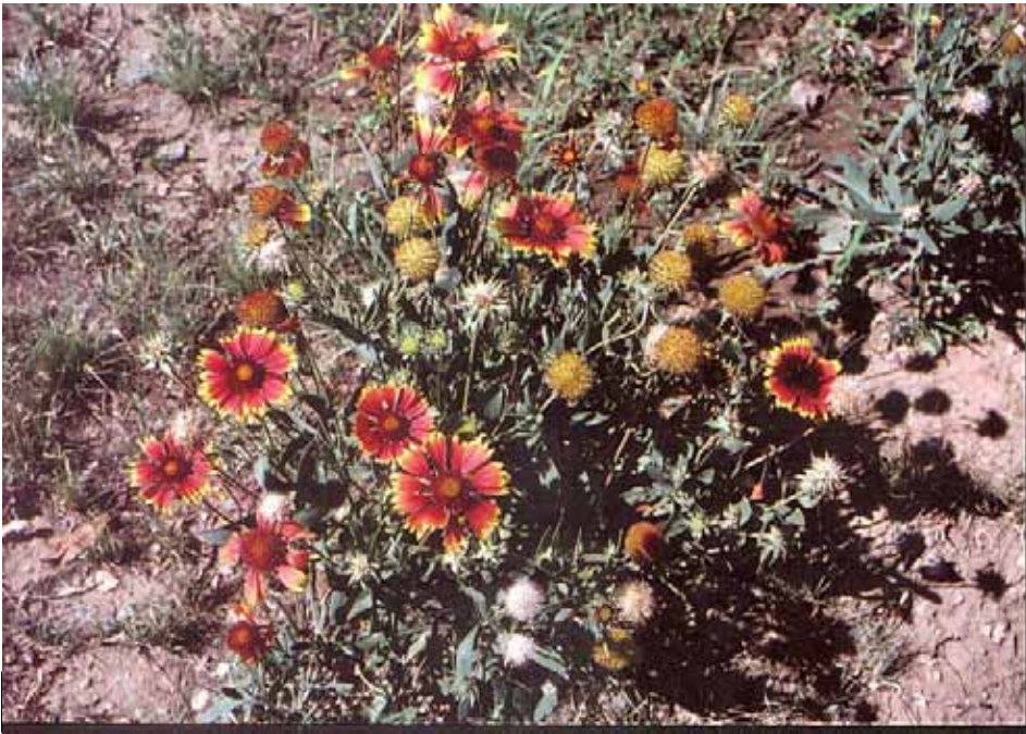
Photograph 29. July 29, 2001. Blanket flower ( Gailardia pulchella )