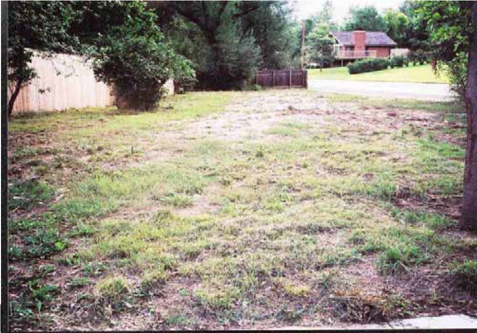
Photograph 1. Northwest-facing view toward Alpine Street Summer 1999.