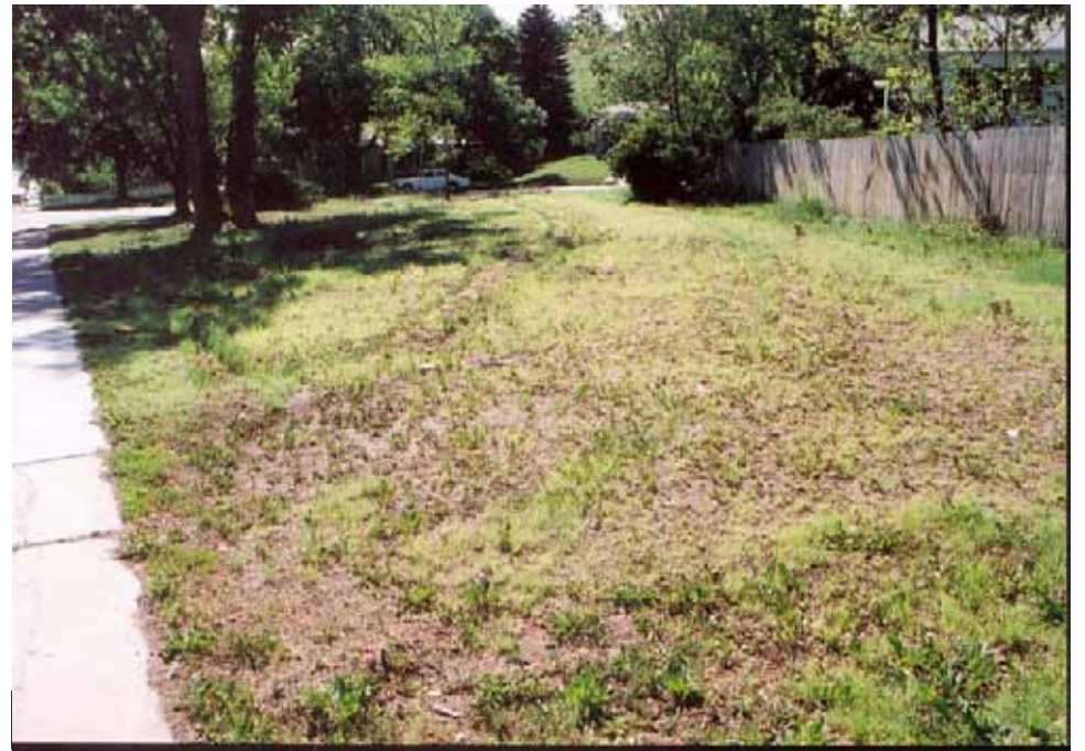
Photograph 24. June 11, 2001.