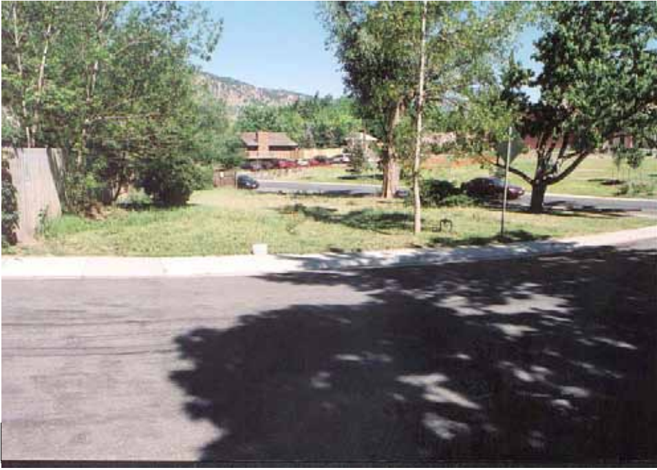
Photograph 21. June 11, 2001.