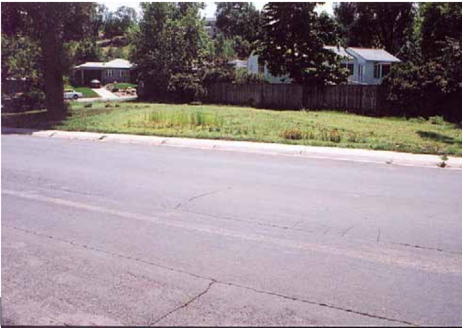
Photograph 35. August 18, 2001.