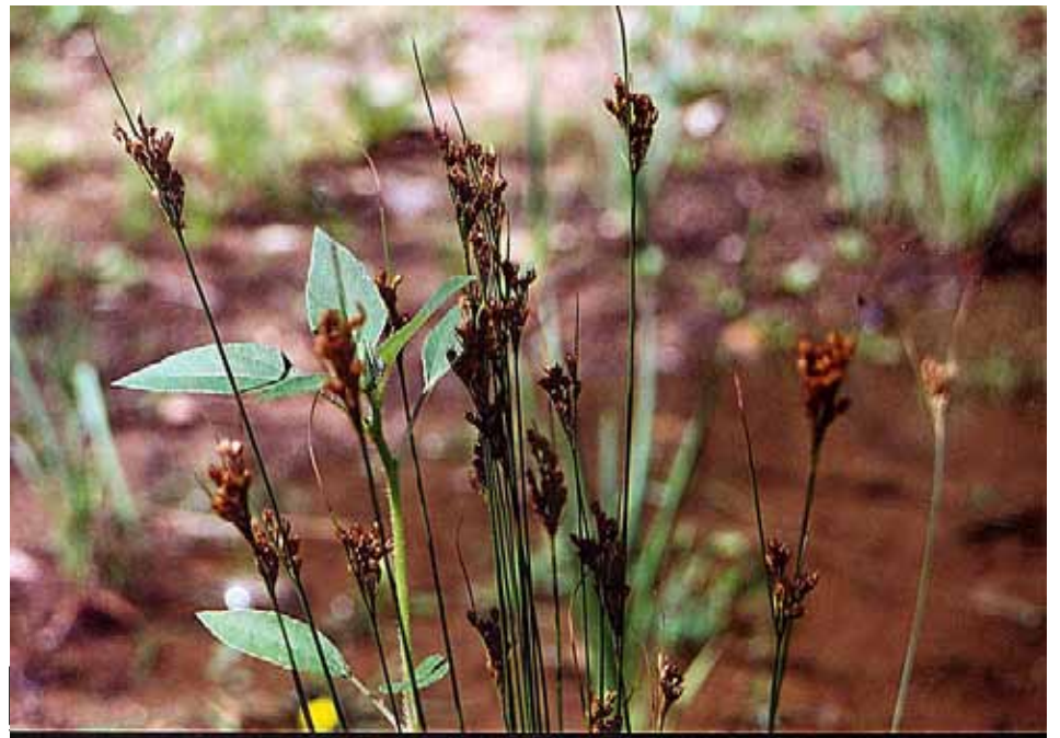
Photograph 32. July 29, 2001. A rush Juncus interior .