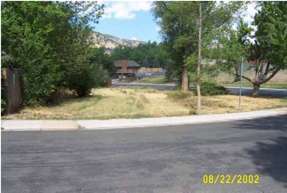
Photograph 41. August 22, 2002.