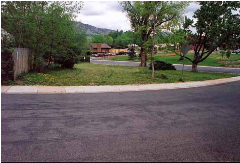
Photograph 17. May 16, 2001.