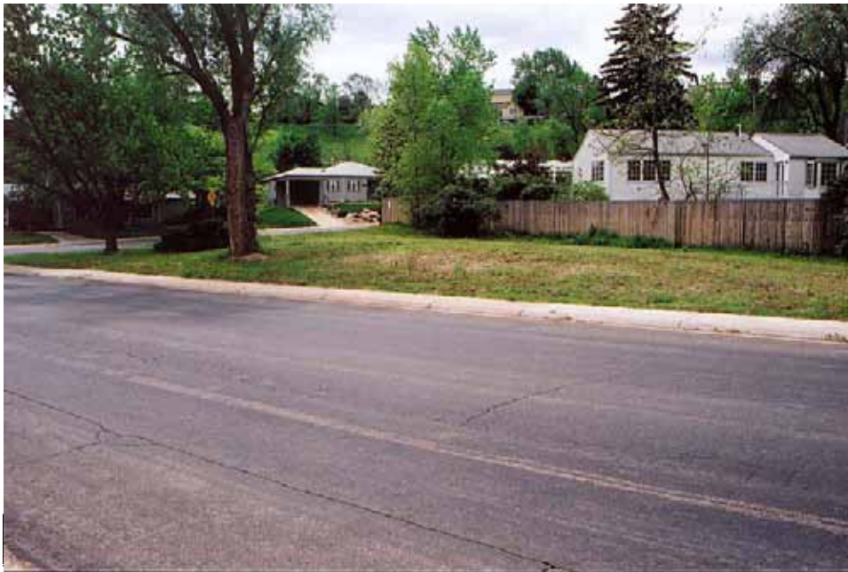
Photograph 19. May 16, 2001.