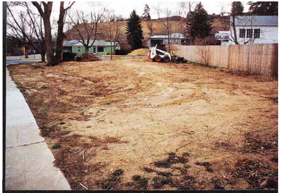
Photograph 4. Site preparation. No topsoil was added. End of March 2000.