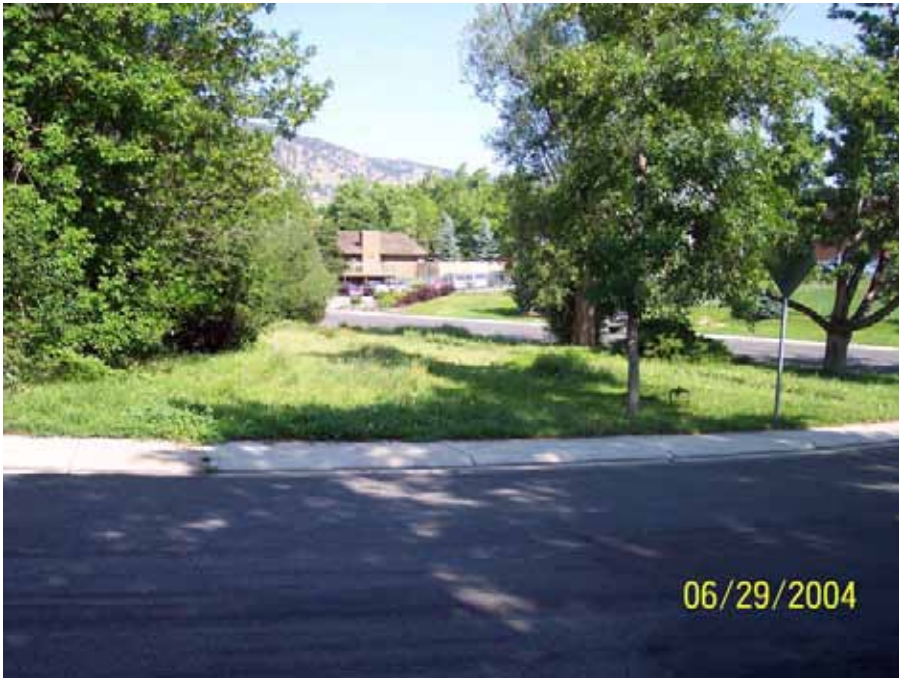
Photograph 45. June 29, 2004.