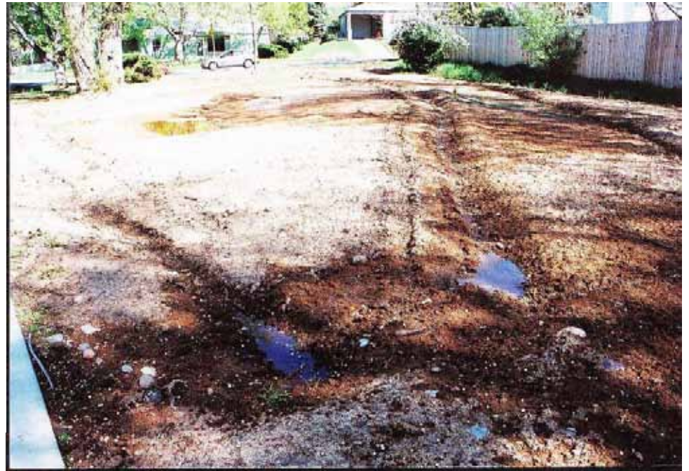
Photograph 10. May, 2000.