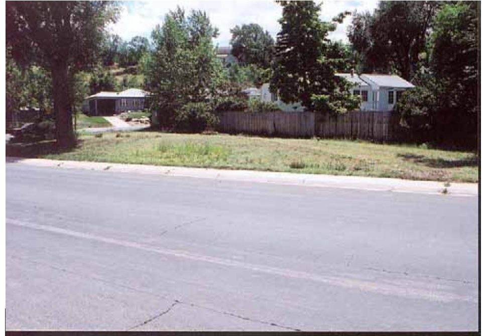
Photograph 26. July 29, 2001.