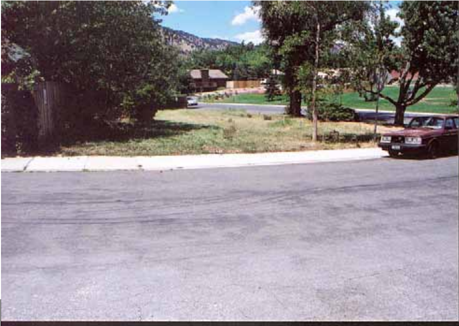
Photograph 25. July 29, 2001.