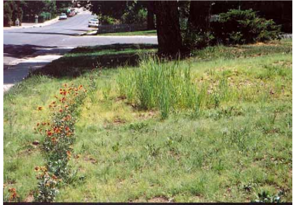
Photograph 34. August 18, 2001.