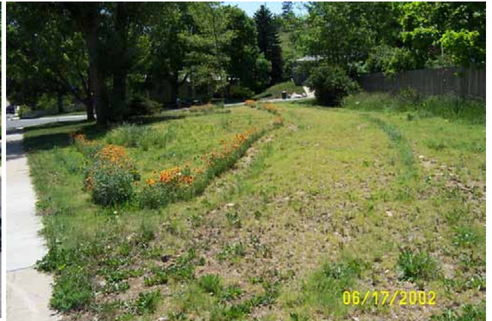
Photograph 38. June 17, 2002.