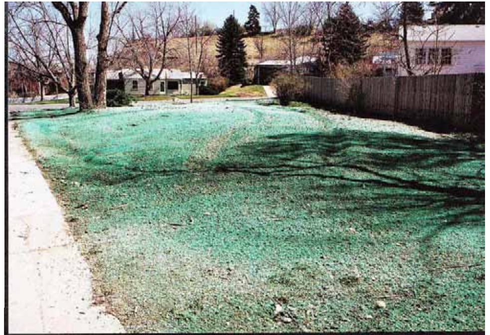
Photograph 6. After application of seed and hydraulic mulch. April 2000.