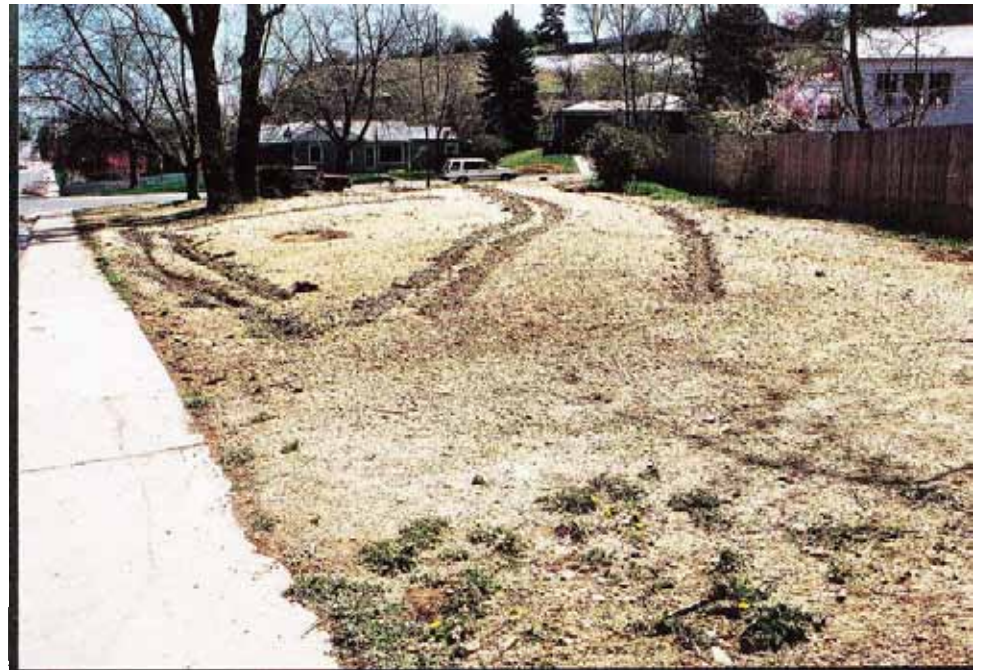
Photograph 8. After planting additional flower seed and hawthorn. April 16, 2000.