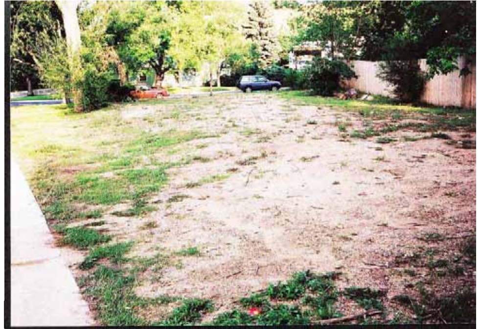
Photograph 2. Southeast-facing view toward North Street. Summer 1999.