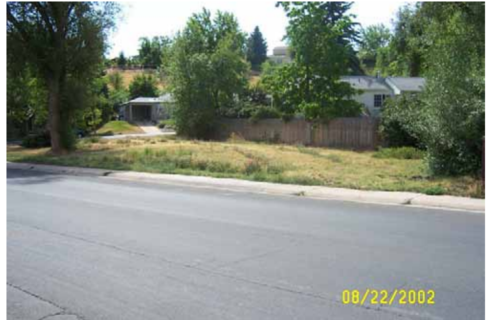
Photograph 42. August 22, 2002.