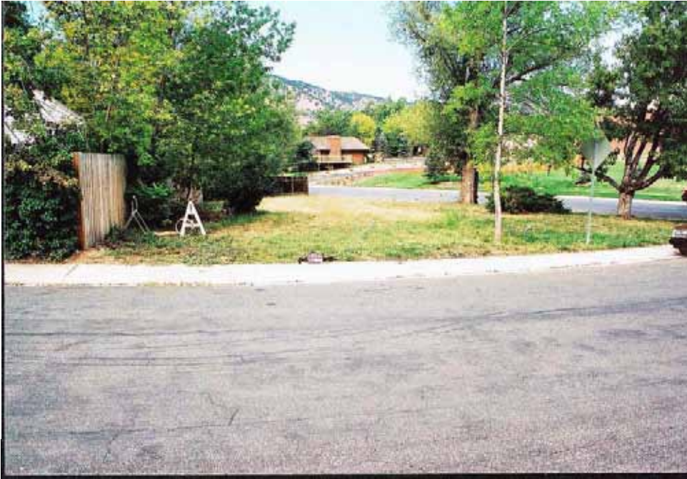
Photograph 13. October 1, 2000.