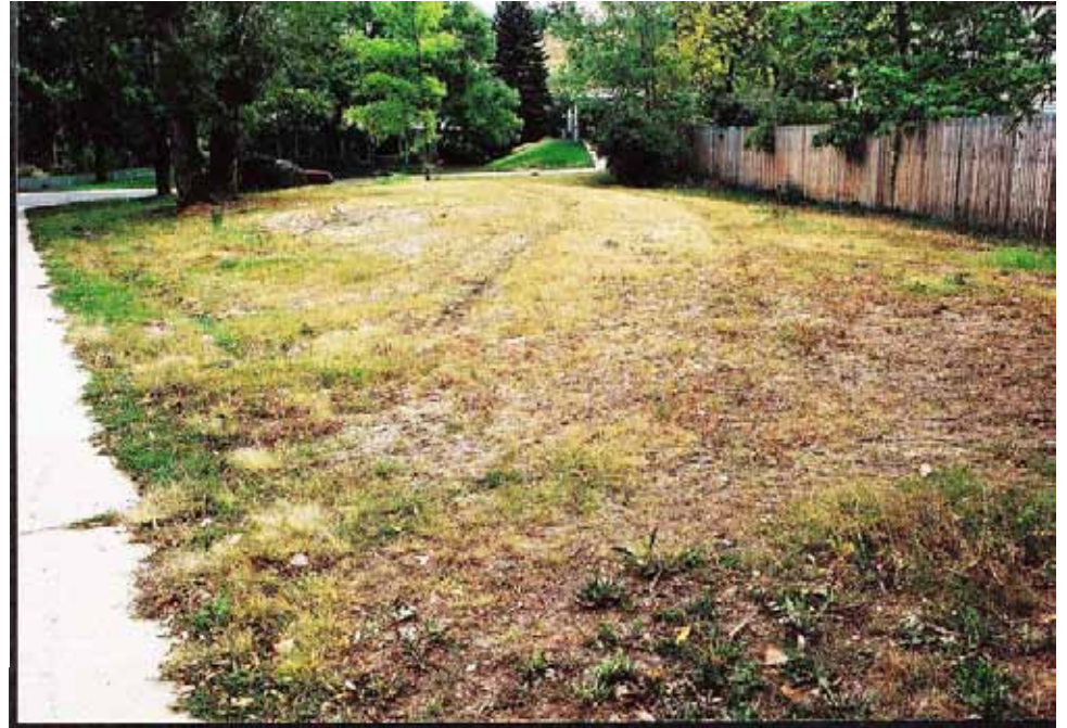
Photograph 14. October 1, 2000.