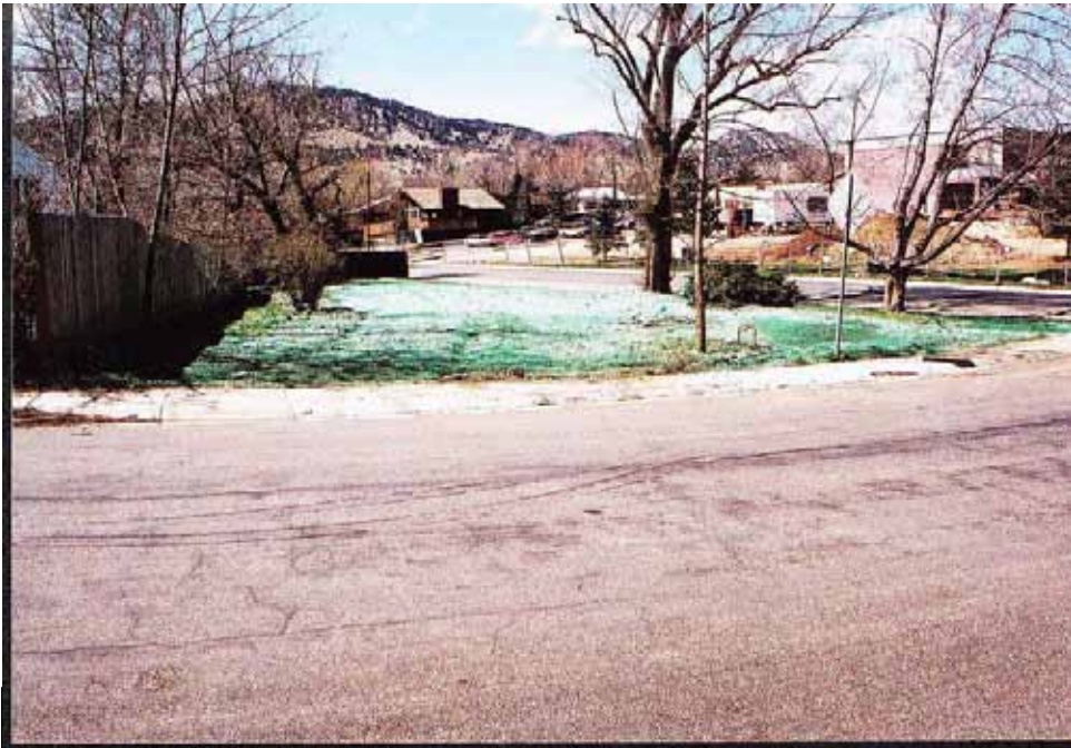
Photograph 5. After application of seed and hydraulic mulch. April 2000.