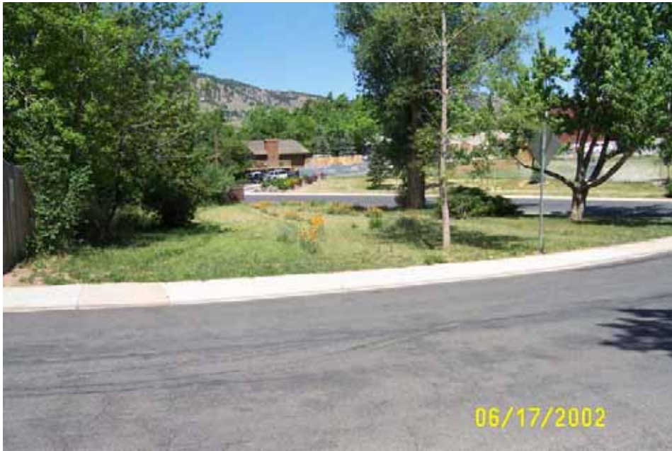
Photograph 37. June 17, 2002.