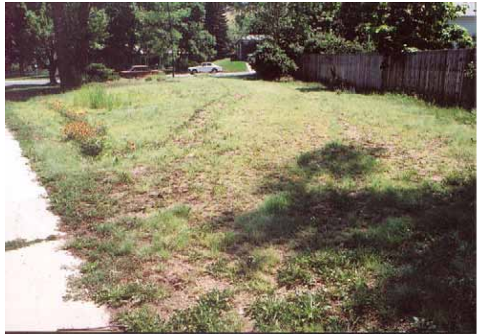
Photograph 36. August 18, 2001.