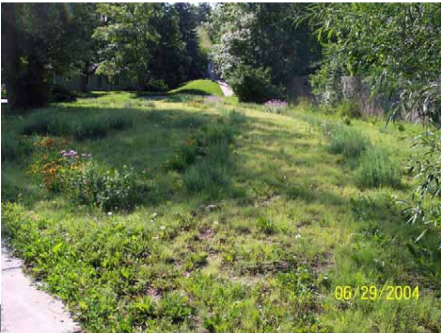
Photograph 47. June 29, 2004.