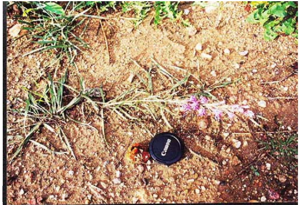
Photograph 16. Liatris punctata that was planted and flowered Summer 1999.