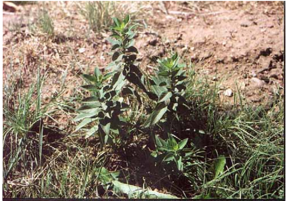
Photograph 30. July 29, 2001. Beebalm ( Monarda fistulosa ) no flowers yet.