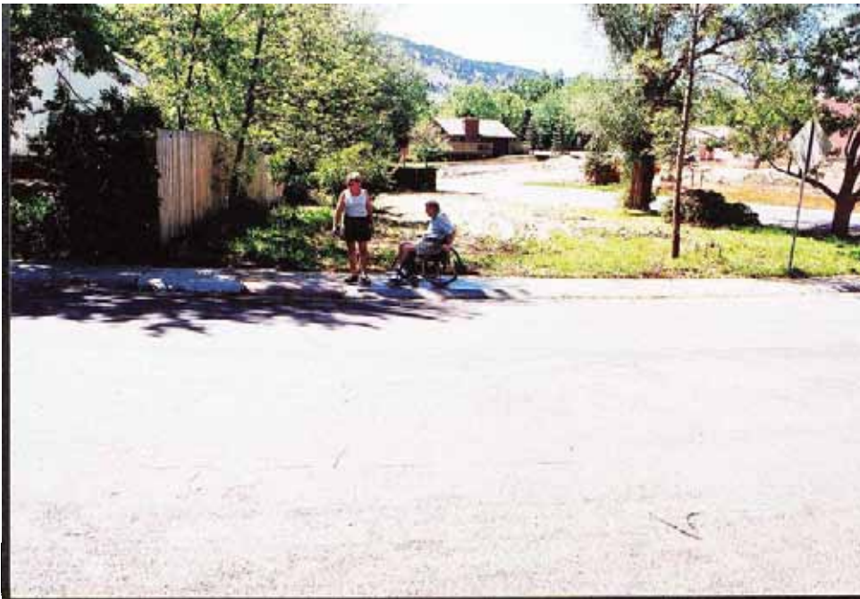
Photograph 11. June, 2000.