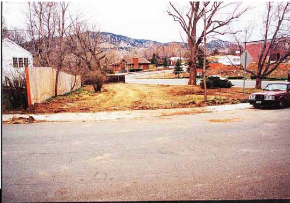
Photograph 3. Site preparation. No topsoil was added. End of March 2000.