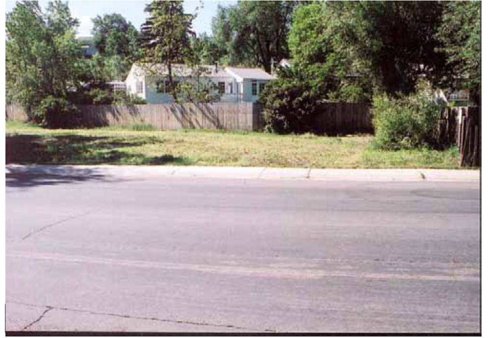
Photograph 22. June 11, 2001.