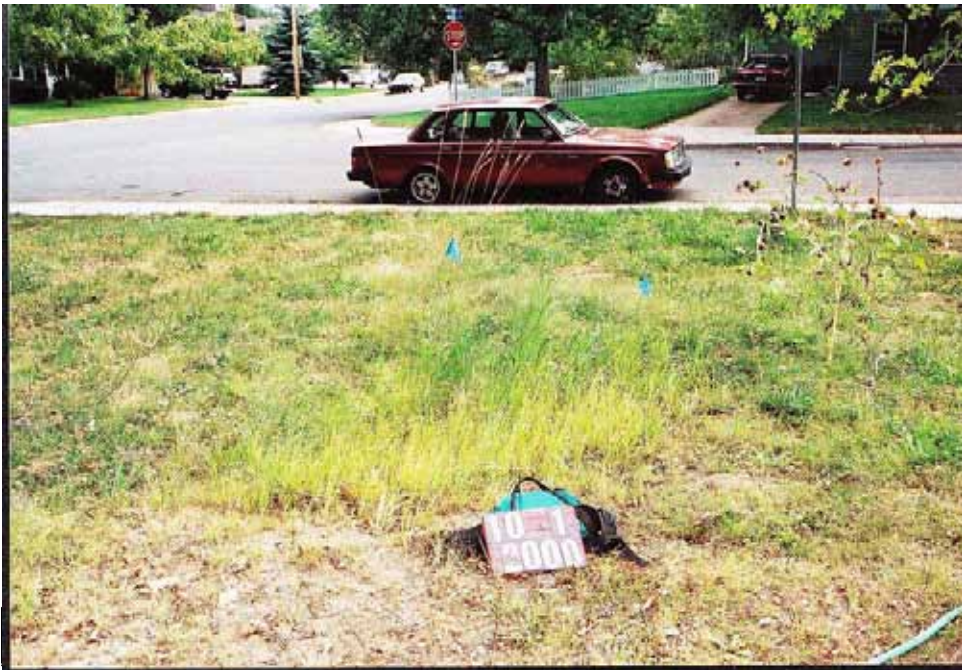
Photograph 15. October 1, 2000.