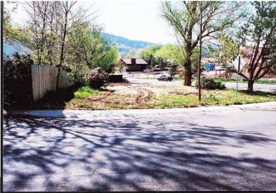
Photograph 9. May, 2000.