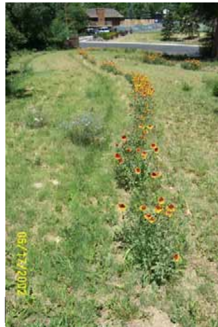
Photograph 40. June 17, 2002.