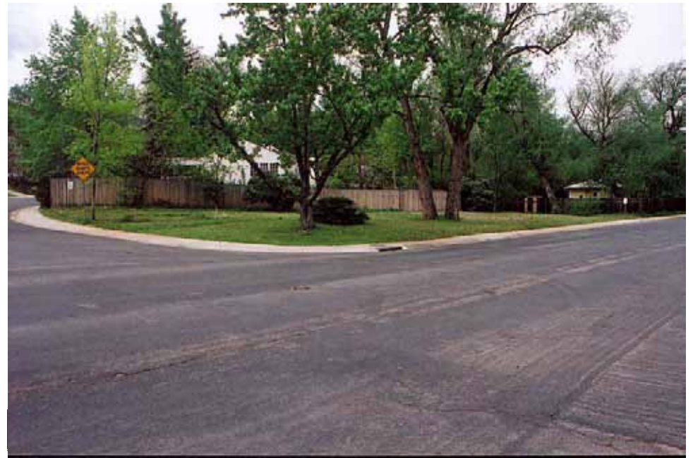
Photograph 18. May 16, 2001.