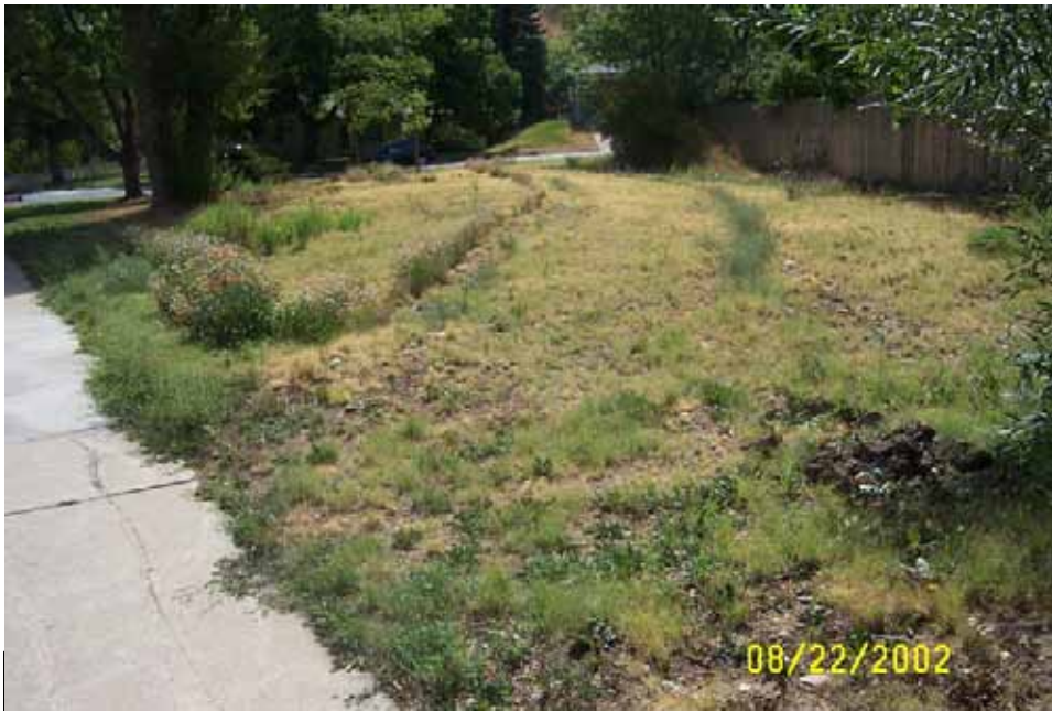
Photograph 43. August 22, 2002.