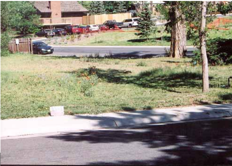
Photograph 23. June 11, 2001.