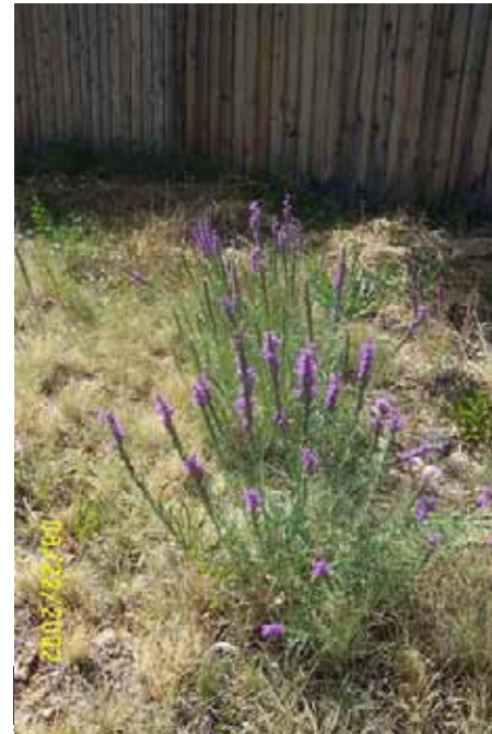
Photograph 44. August 22, 2002.