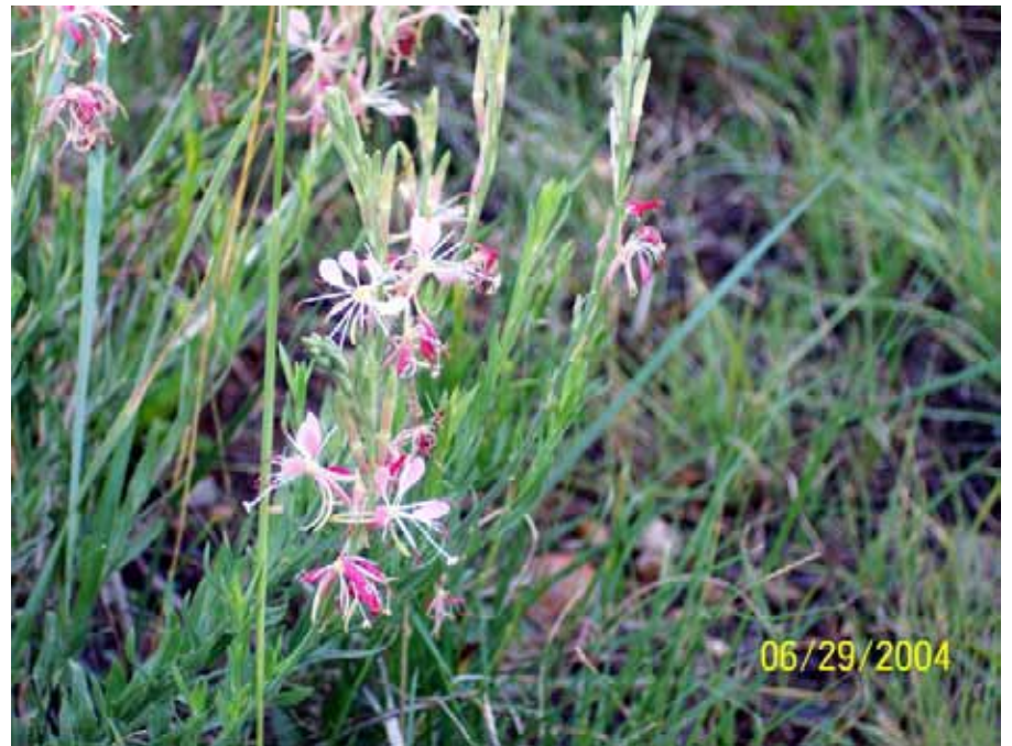
Photograph 48. June 29, 2004.