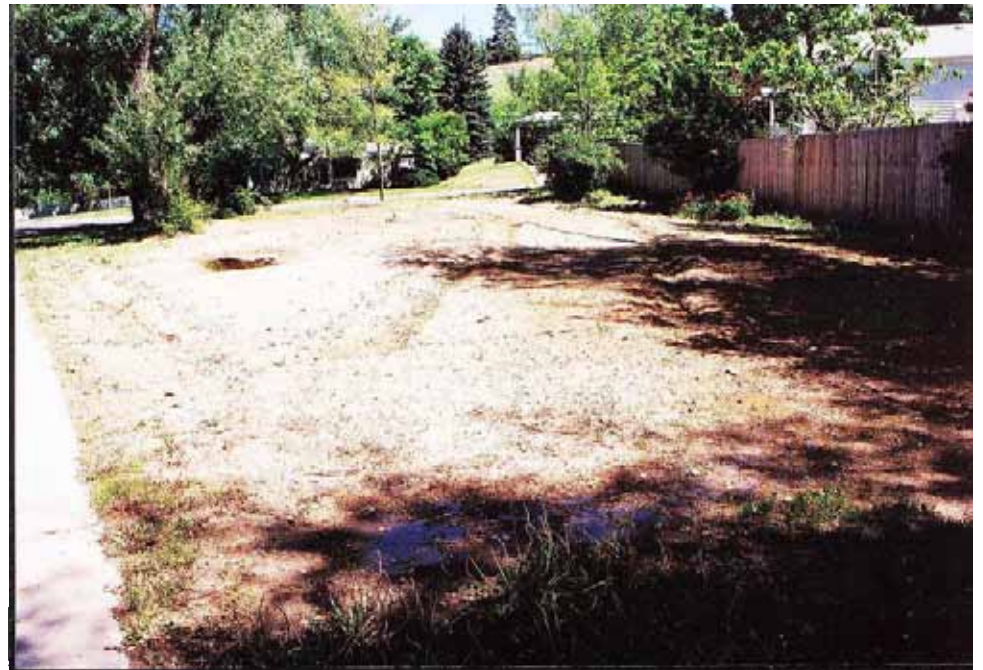
Photograph 12. June, 2000