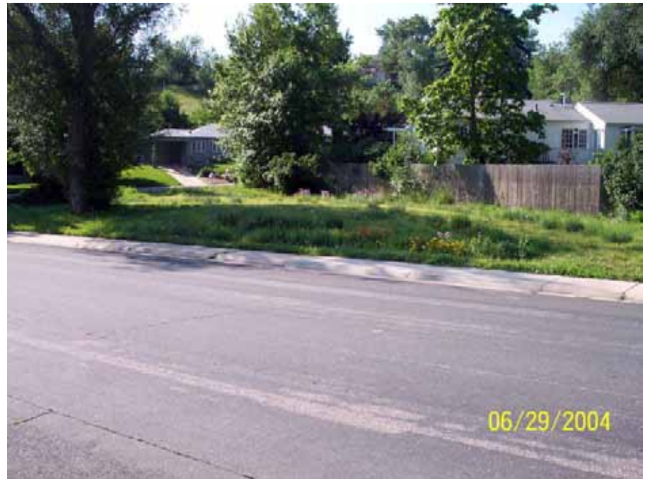
Photograph 46. June 29, 2004.