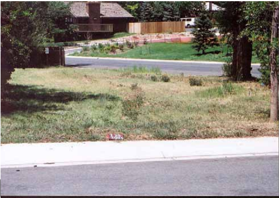
Photograph 27. July 29, 2001.