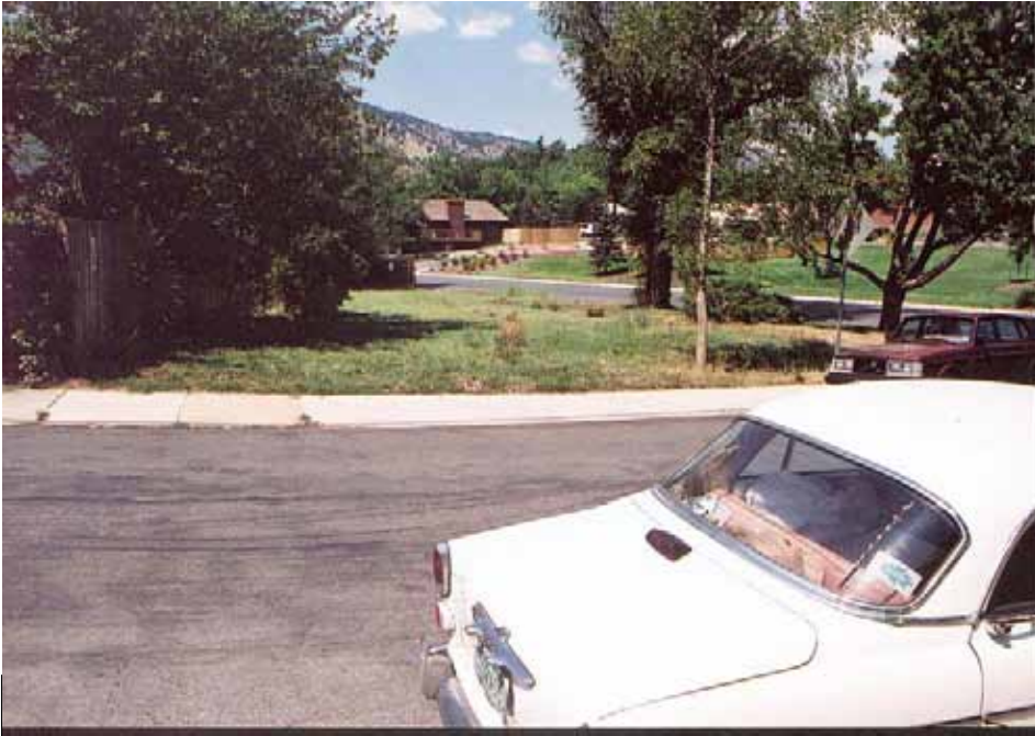
Photograph 33. August 18, 2001.