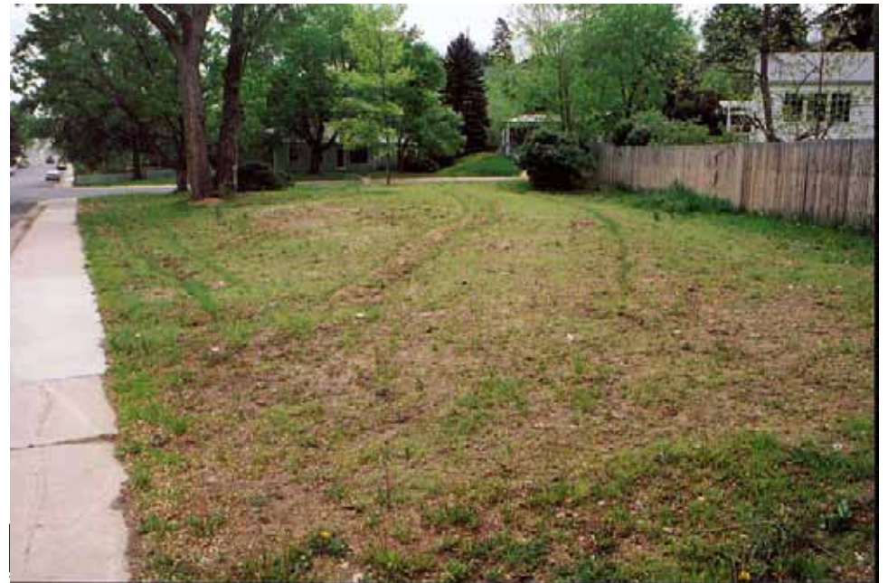
Photograph 20. May 16, 2001.